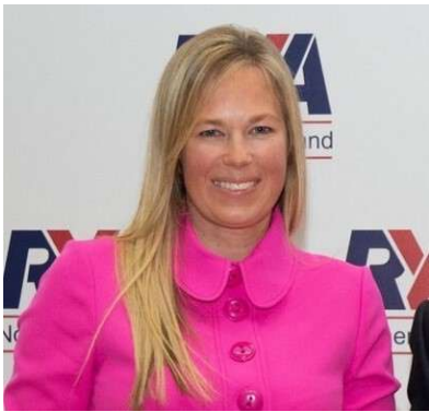
COMMODORE Lindsay Nolan