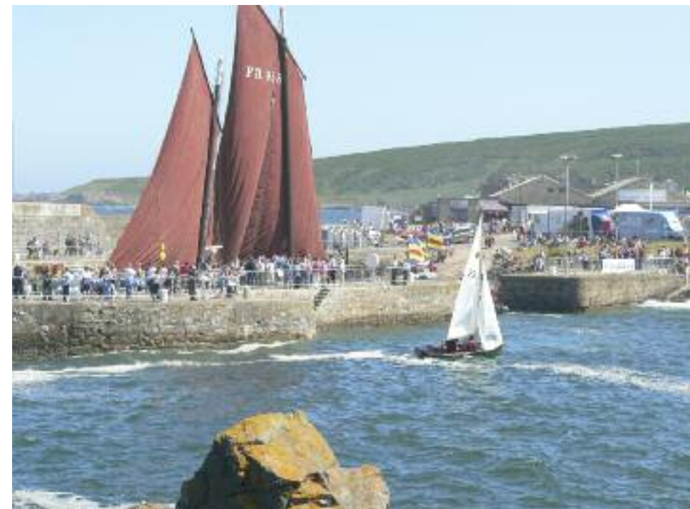
Coming into harbour at the Portsoy Boat Festival