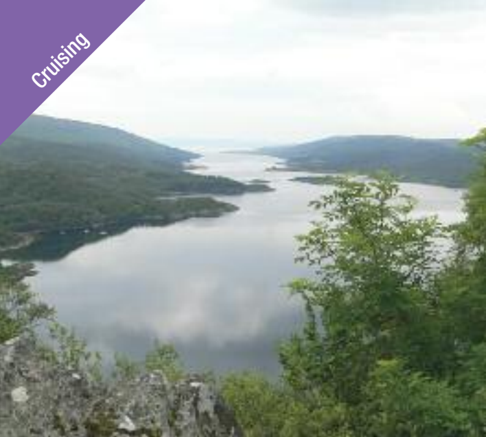
Looking down to Loch Riddon

There was a gap now for three weeks (time for a holiday, I think) before I sneaked back into Wales – this time to Aberdovey. This was with the GP14 Vintage Section – not to be confused with the GP14 Cruising Section. I attended this event last year on the 60th anniversary of the first launch of the GP14 at Aberdovey. It was a pleasure to be back especially with my 1950 GP14 no. 28 Aeolian . We could only manage two short sails in the weekend, as the good old Welsh weather struck with some vengeance. There is a great tidal race just off-shore which provides an interesting sail, especially with a leaky, vintage boat. I had a near miss with a whale . . . at least I think I did, or it might have be me dreaming about where to sail next year.