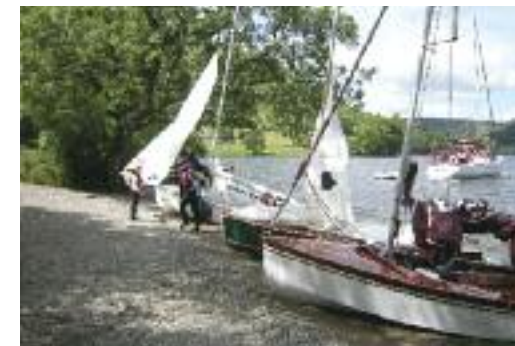
On the shore at Ullswater

This was a new event on the calendar this year, and was most enjoyable despite the disappointingly small number of boats that were able to attend. In fairness, two participants who had every intention of joining us then unavoidably had to drop out, one because of an enforced job change which left him working that weekend, and the other – actually on the morning of their intended arrival – because his son sustained an injury while fell-walking and they needed to get him home.