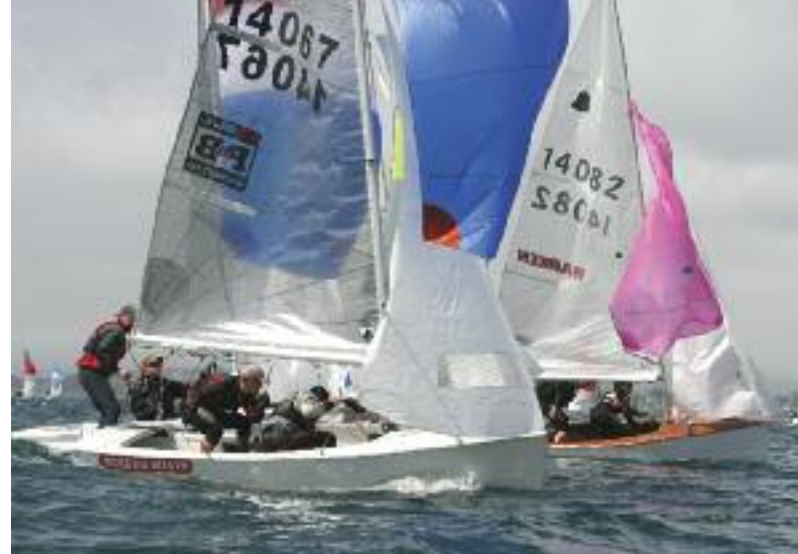
The 2011 Nationals at Abersoch

From the information received it is clear that every report we publish in Yachts & Yachting is read by many hundreds of GP14 followers and the sailing fraternity in general, confirming that our postings are valued by the readership and are an excellent way of promoting our class and its activities – all for free!