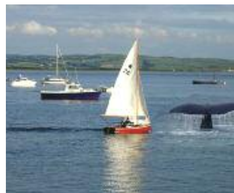
Meeting a whale at Aberdovey