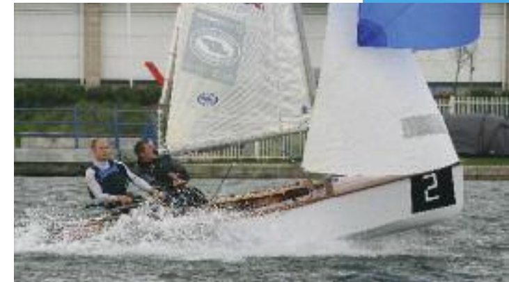
The new boat performing well at the 2011 24hr Race