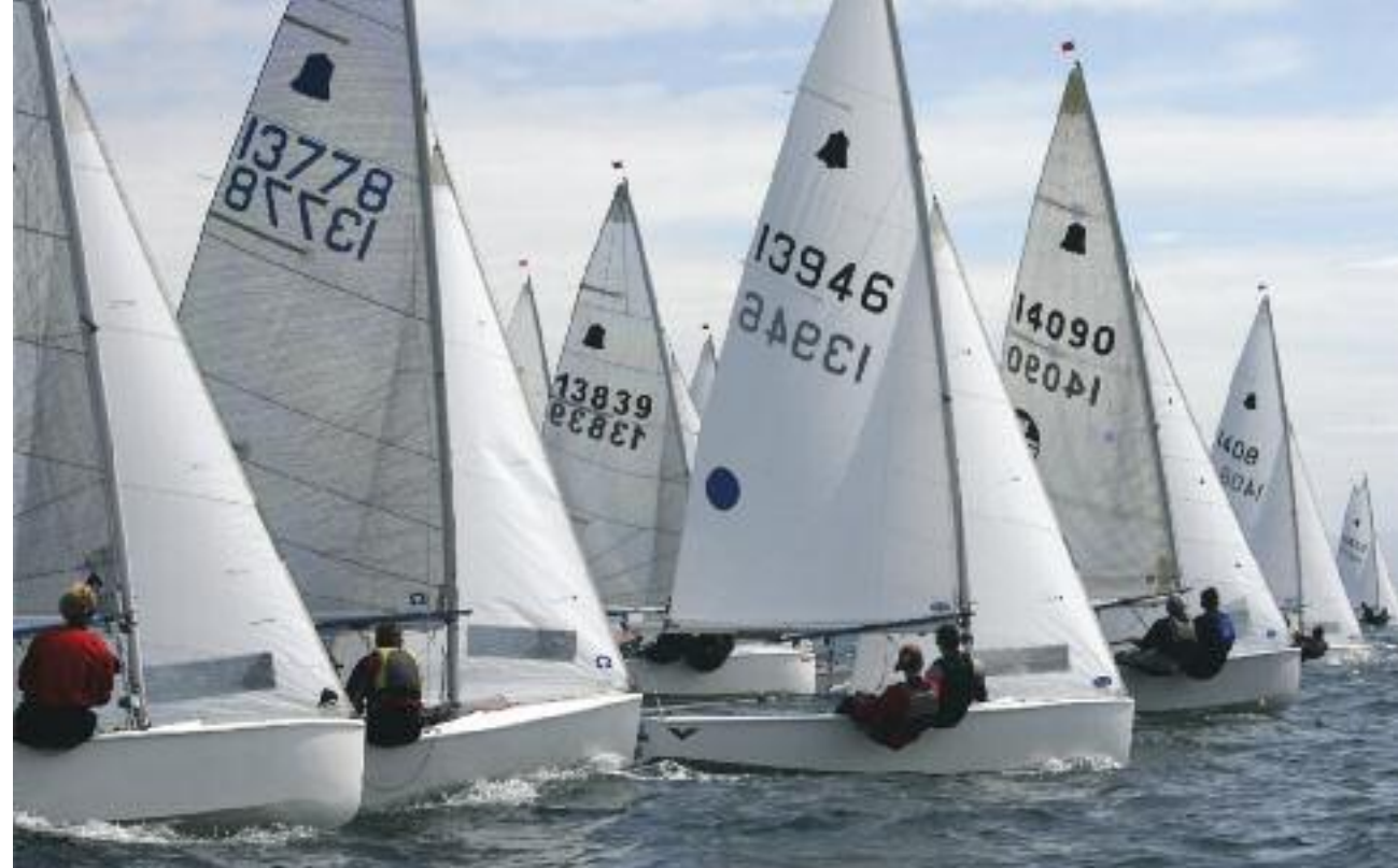
At the Nationals 2011