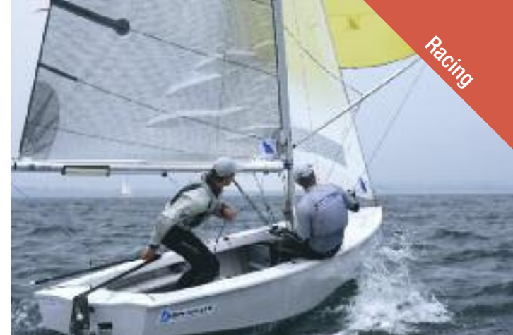
Stuart and Christian

Hull: Boon Boats Epoxy GP14 Foils: Boon CNC Epoxy foils Sails: Goacher laminate Spars: Selden Cumulus