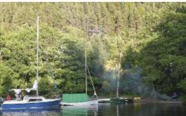
Camping at Foyers on Loch Ness

The Caledonian Canal for us was a major expedition. Other boaters see it as a bit of relief from sailing and purely as a short-cut from one sea to the other. But – these boats have engines – our two GPs just had oars. The canal itself consists of 22 miles of actual canal and 38 miles of open water (Lochs). The longest of these is Loch Ness which is 22 miles (this took us two days). The facilities provided by British Waterways were very good and at most locks (not to be confused with lochs) there were toilets and often showers. A camping site was also freely available