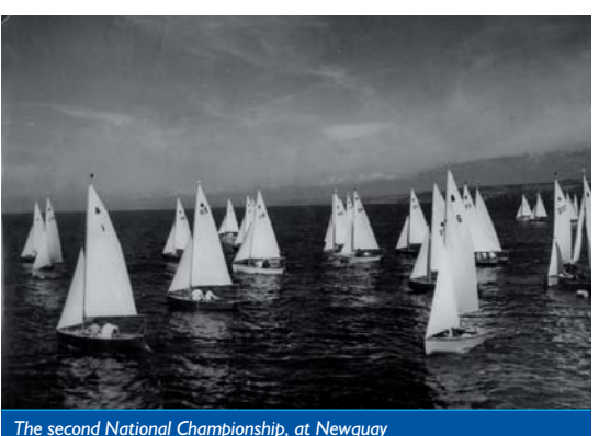
The second National Championship, at Newquay

A lesson for young crews, never assume your skipper has seen something, they're all blind. Tell him, tell him again, then bore him to death with it, just make sure he knows.