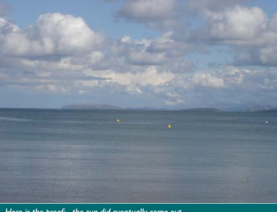
Here is the proof; the sun did eventually come out, just as I was packing up to bring the boat come home!