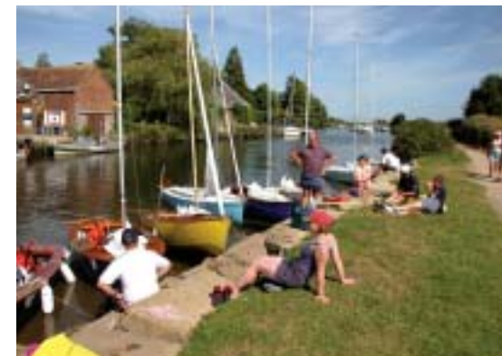
Upriver to Wareham for a pint and a picnic.