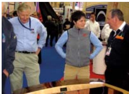
Ellen MacArthur chatting to ? at the Dinghy Show. Ellen learnt to sail in a GP14.