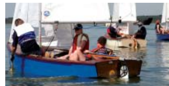
Family fun at Poole.