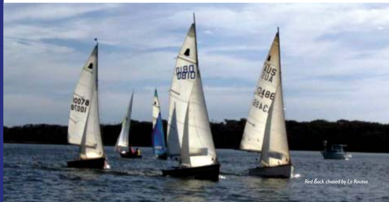
Red Back chased by La Rousse