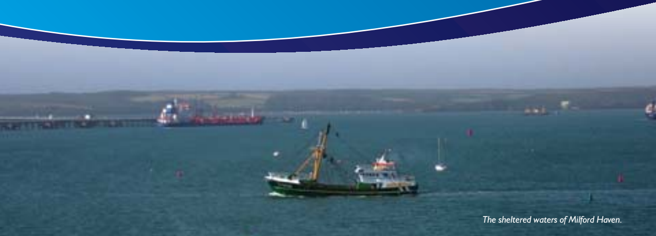
The sheltered waters of Milford Haven.