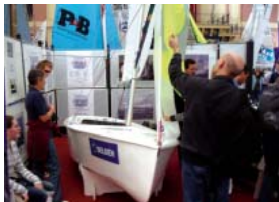
Taking a closer look – Dinghy Exhibition 2007