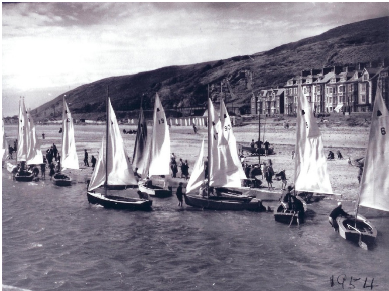
Aberdovey 1953 or 1954