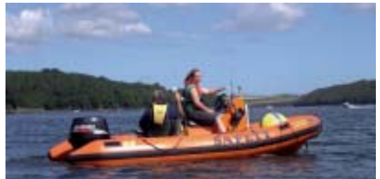
Naomi, Escort RIB, Beggars Reach

With the light and flukey winds that we had for quite a lot of the day we found for the first time that overall we were sailing somewhat slower than many of the other boats, which was somewhat of a surprise, and it did go slightly against the grain to be beaten home by a group of three teenagers from the Neyland club! Clearly light and flukey winds are not our strong point.