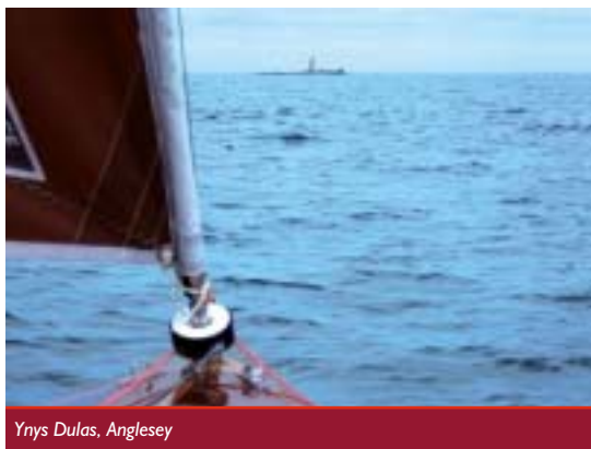
Ynys Dulas, Anglesey

Continued car trouble prevented my getting to the Weir Quay weekend so I regret that I have no information there.