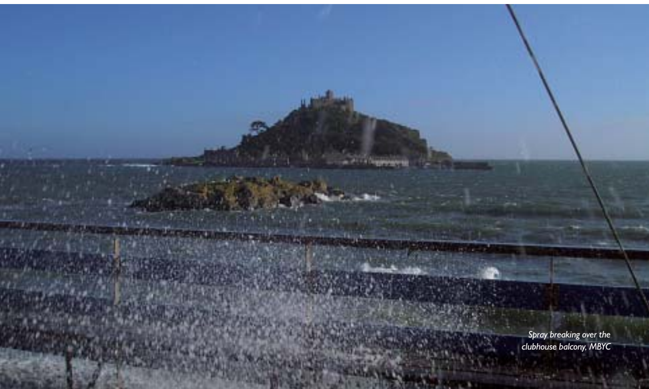
Spray breaking over the clubhouse balcony, MBYC