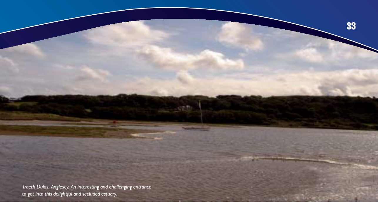
Traeth Dulas, Anglesey. An interesting and challenging entrance to get into this delightful and secluded estuary.