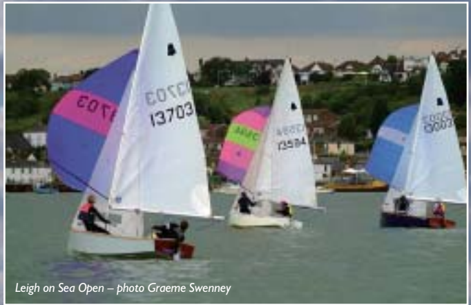
Leigh on Sea Open