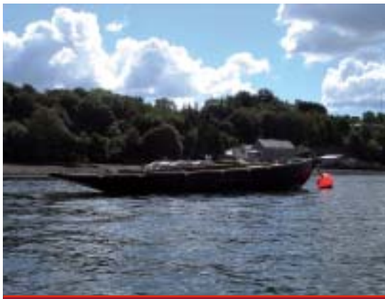
Prawner-type yacht, without a mast, slightly larger (?) sister-ship to Quest

Then upriver to a picnic site at Llangwm, with picnic tables and seats provided, and an attractive view of the river.