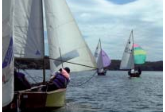
Return from Llangwm; Castle Reach

With the light and flukey winds that we had for quite a lot of the day we found for the first time that overall we were sailing somewhat slower than many of the other boats, which was somewhat of a surprise, and it did go slightly against the grain to be beaten home by a group of three teenagers from the Neyland club! Clearly light and flukey winds are not our strong point.