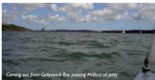
Coming out from Gellyswick Bay passing Milford oil jetty