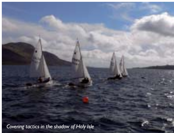
Covering tactics in the shadow of Holy Isle

The 'S' shaped course, with an initial beat followed by a short reach, then a run, followed by a second short reach and a beat to finish, provided plenty of tactical upwind and downwind legs as well as numerous buoy roundings. Whilst not sailing, the competitors enjoyed the spectacle from an impressive ketch with plenty of nourishment aboard.