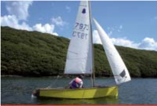
Charlie & Dorette Lomas

Then on arrival we found an attractive pub on the waterfront, and were able to use their beer garden with its pleasant view of the anchorage to enjoy our picnic lunch, suitably lubricated by the offerings of the pub.