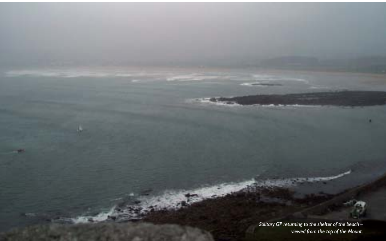
Solitary GP returning to the shelter of the beach – viewed from the top of the Mount.