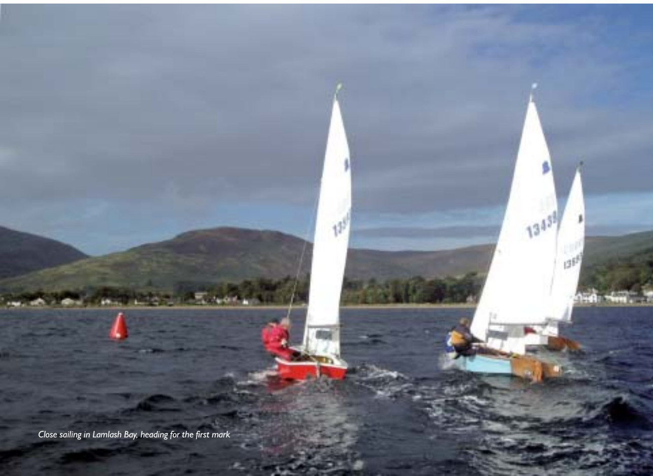
Close sailing in Lamlash Bay, heading for the first mark