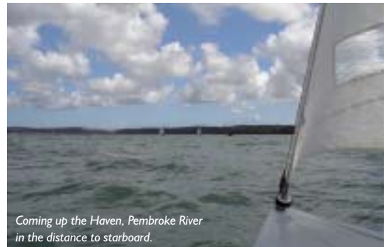
Coming up the Haven, Pembroke River in the distance to starboard.