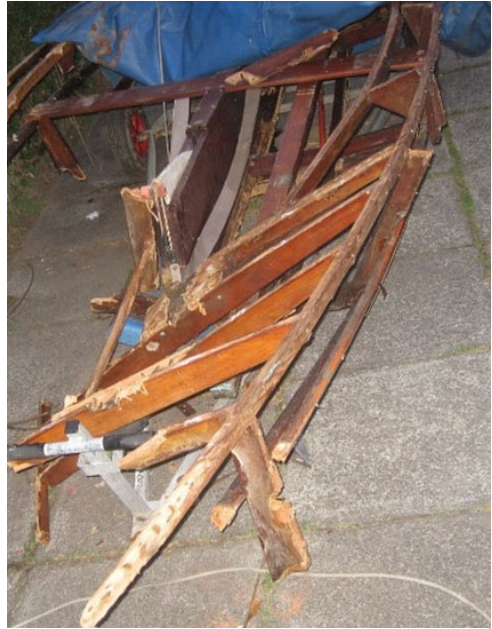
Quiver awaits reassembly. No 3 will live again!