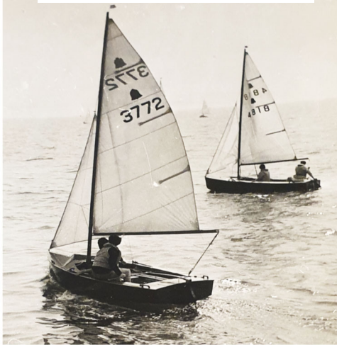
Carrickfergus R&SC Regatta-61 or 62