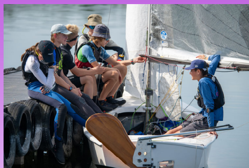
Above: Youth Championships at South Staffs SC