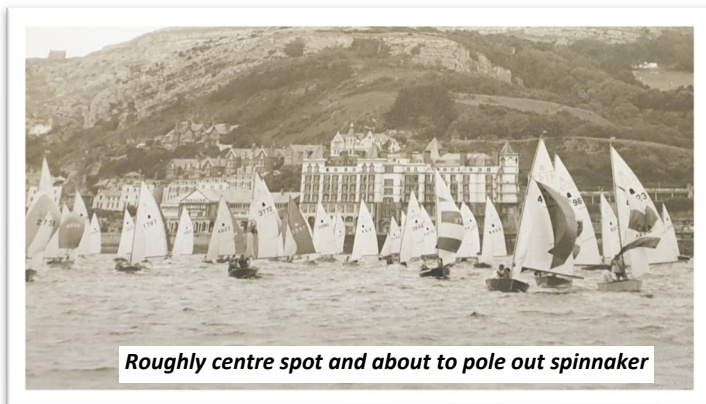
Roughly centre spot and about to pole out spinnaker

The entry at Llandudno in 1963 was a little over 220 boats. We shipped our six boats to the venue by British Rail - it was the cheapest as ro-ro ferries were in their infancy and still expensive. Most of the boats were home or amateur built. With so many boats most launched down the beach. The easiest way to get the boats up and down the beach was to carry them.