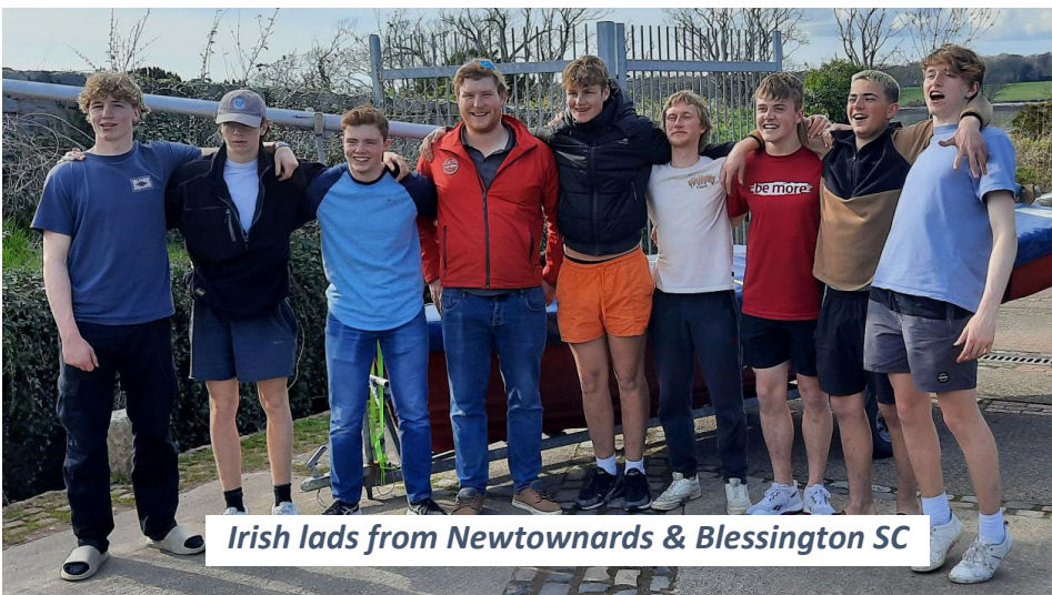
Irish lads from Newtownards & Blessington SC