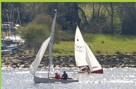
Above: Burwain Open winner & 2 nd see Northern area report Front Page: Skerries Sailing Club, Ireland

Published by the GP14 Class International Association Albert House, 42 Seymour Road Astley Bridge, Bolton BL1 8PT T: +44 (0) 1204 590325 E: admin@gp14.org