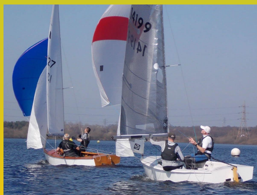
Above: Midland Area Championships at Chase SC